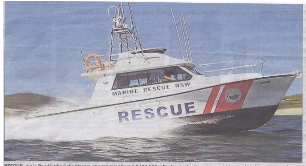
RESCUE: Jervis Bay 40 (the Colin Woods) was returning from a $420,000 refit when tasked to rescue a stricken yacht in heavy seas on Sunday.

When you have had enough! ... Remember ... If you want to stop Crime ... I mean ... You really want to stop Crime ... Commit yourself to a SIGNED STATEMENT and you will REALLY give your POLICE something to WORK WITH!