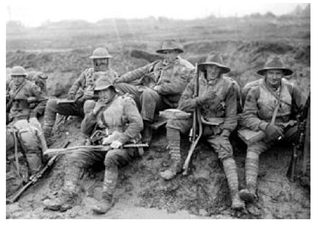
Some of the First Australian Imperial Force who made up the ANZAC

May all of those who fight for the freedom of others, be blessed for eternity, as they are the purest of heart! - Lest We Forget