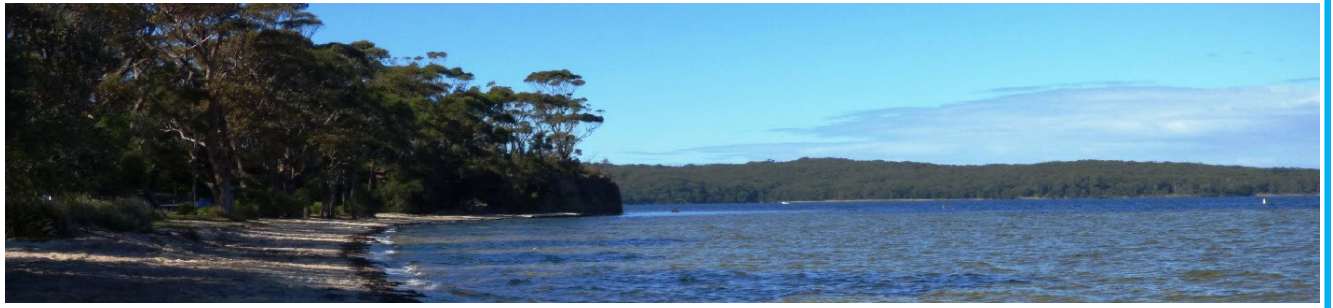
Photo of Palm Beach Sanctuary Point NSW on a clear day...