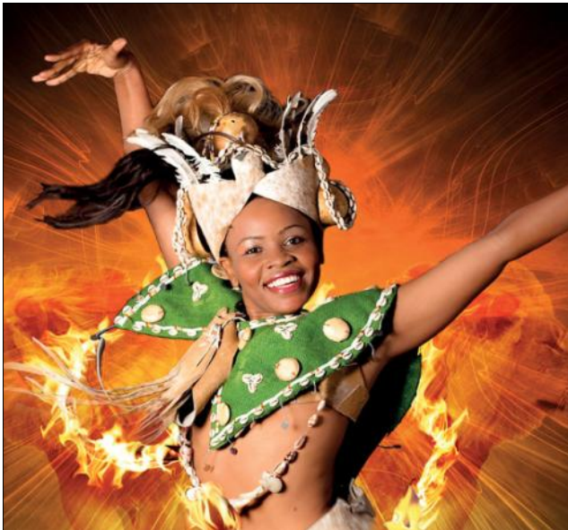
Cirque Mother Africa Friday 14 April | 7.30pm