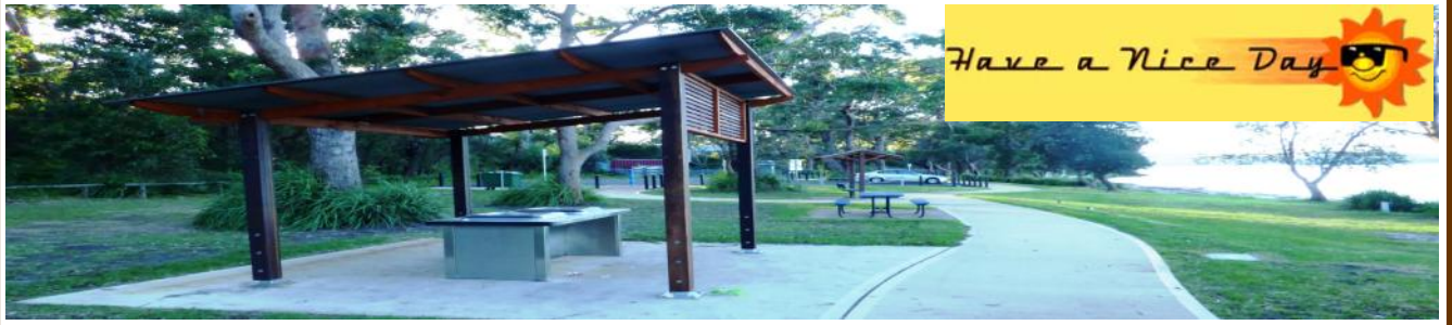
Photo of Palm Beach Sanctuary Point NSW...