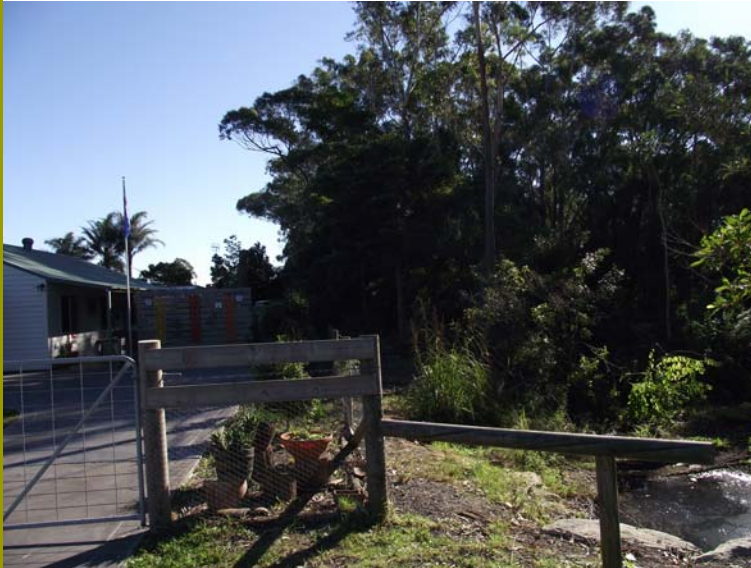
Situation resolved through Better Communication