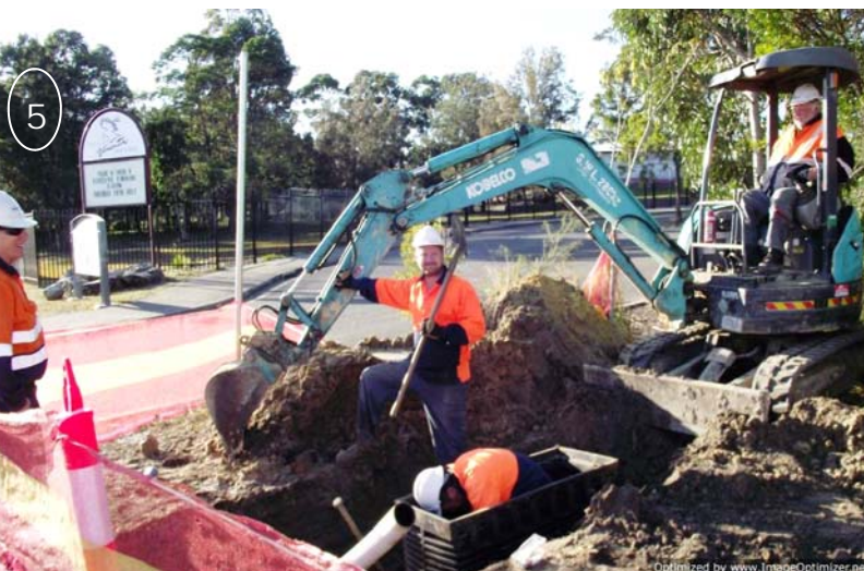
Photo 5: Construction work being carried out by BMD Field Operatives, who after challenging me, as why I was taking photos in the area, I was given the all clear and was given permission to take this photo.

Photo 4: This photo shows where the Leisure Centre Access Road will be in relation to the Leisure Centre and the Car Park which will not be disturbed.