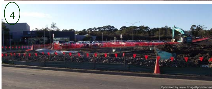
Photo 4: This photo shows where the Leisure Centre Access Road will be in relation to the Leisure Centre and the Car Park which will not be disturbed.

Photo 3: Well underway on the BBLC Access road and Roundabout.