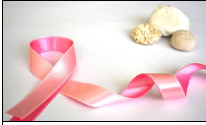
New pain treatment could make a difference after breast cancer surgery

A researcher from The University of Western Australia will trial anaesthetic infusions in breast surgery patients to reduce persistent pain after surgery.