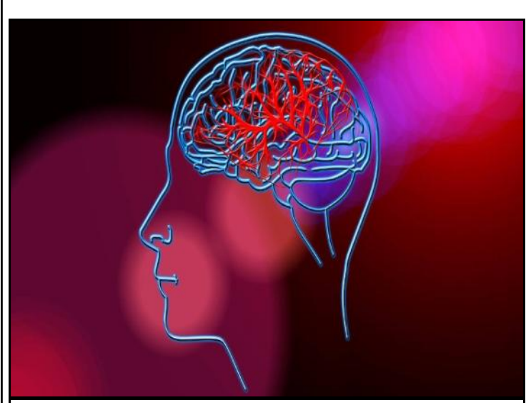
BRAINS TRUST: New procedures, treatments and approaches to care have reduced stroke fatalities, according to new figures.

AUSTRALIANS are much more likely to survive stroke than they were 40 years ago, according to new research.