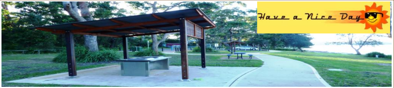
Photo of Palm Beach Sanctuary Point NSW...