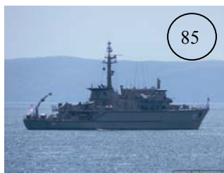
HMAS MELBOURNE (111)