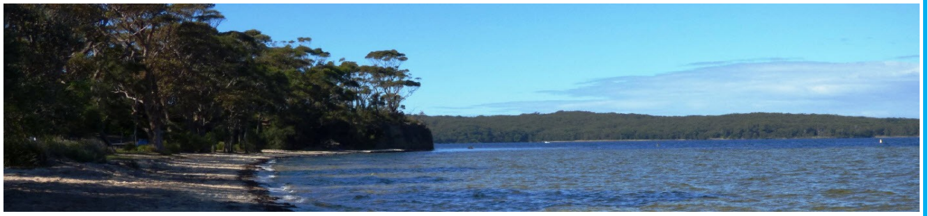
Photo of Palm Beach Sanctuary Point NSW on a clear day...