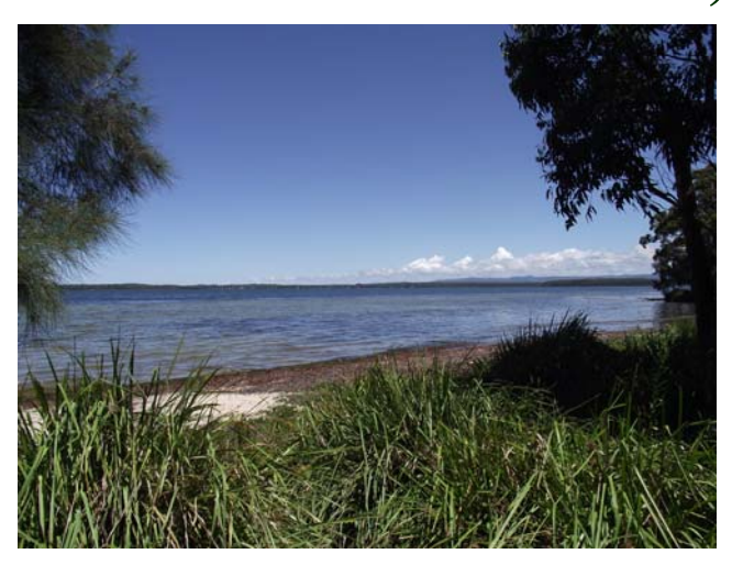
Sanctuary Point Was held on 4th & 5th February 2012