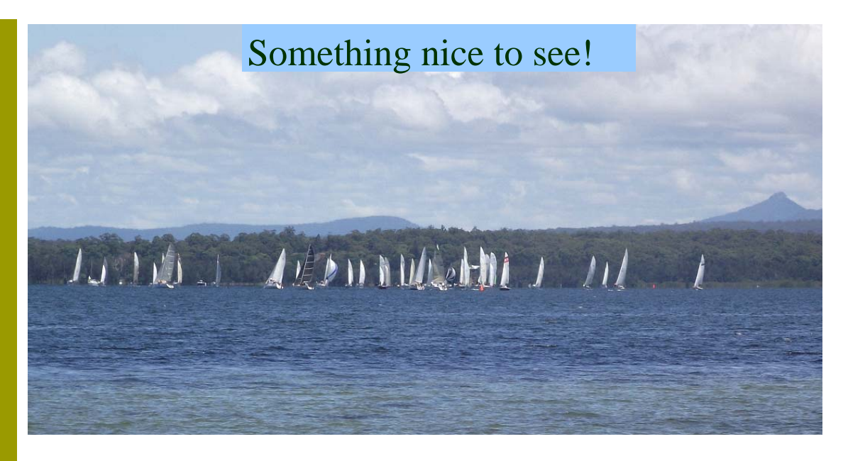
2012 Sussex Inlet & Basin Yacht Club 22 Annual St Georges Basin Trailable Yacht Regatta. as seen from Palm Beach,