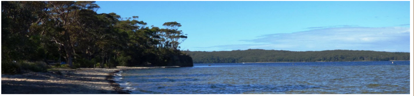
Photo of Palm Beach Sanctuary Point NSW on a clear day...