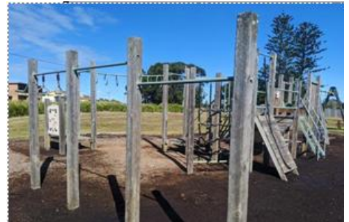
Image: Council is seeking community input to replace Tilbury Cove Reserve Playground at Culburra Beach.