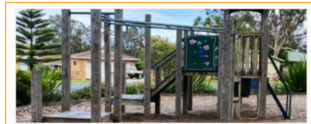
Image: Council is seeking community input to replace Lions Park Playground at Erowal Bay.

Lions Park Playground is located on Naval Parade Erowal Bay. The playground currently includes climbing structures and a slide. As part of Shoalhaven City Council's Playground Replacement Program, Council are looking to replace the existing playground in 2021 as it is coming to the end of its useful life. To ensure the new playground facility meets the need of the current and future community of Erowal Bay, Council would like to know how you currently use the facility, and what kind of playground equipment you would like to see as part of the playground replacement.