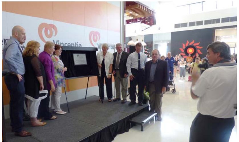
The official opening on the 11th December 2015

How sweet is this, the following email I received by the first customer.