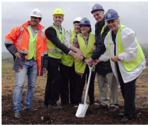
The first sod turning 28th January 2015