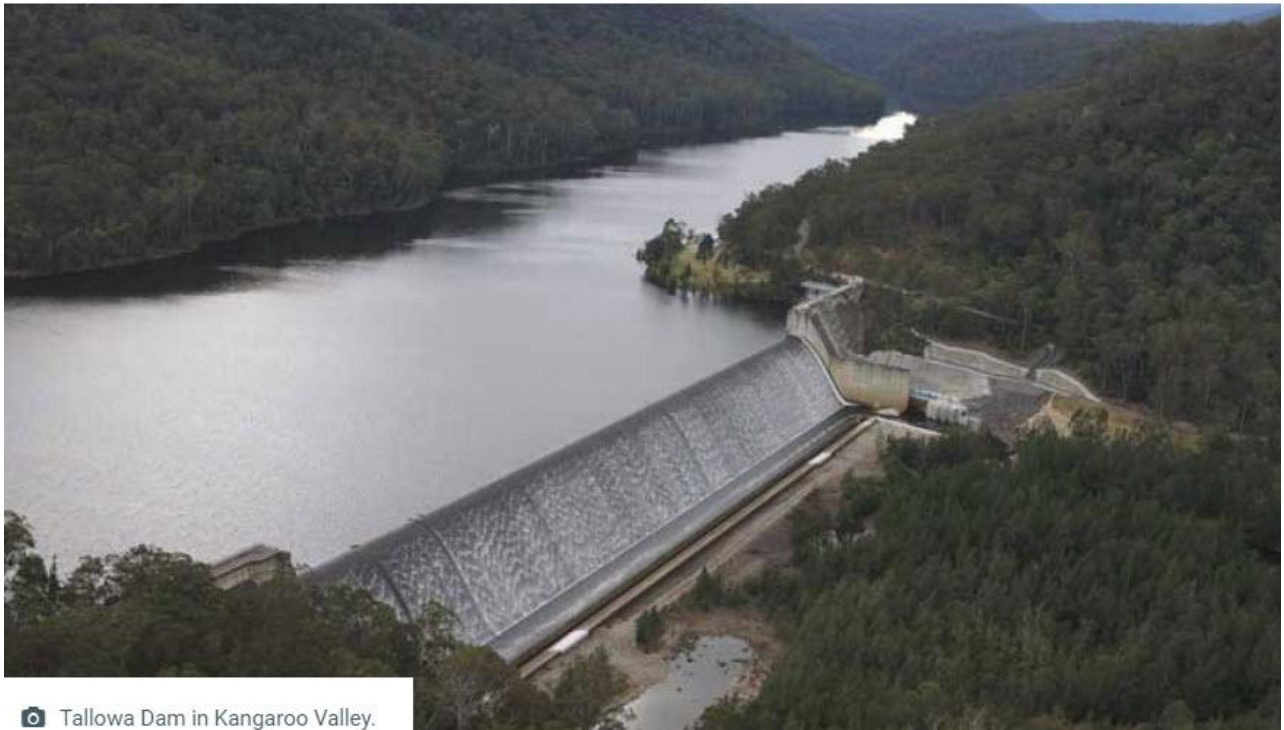
📷 Tallowa Dam in Kangaroo Valley.

Tallowa Dam catchment area is located in Kangaroo Valley; it is owned and operated by the Sydney Catchment Authority.