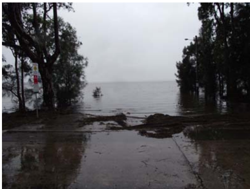
St Georges Basin car park and Boat Ramp