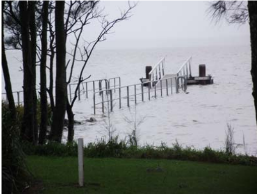
St Georges Basin and the Jetty