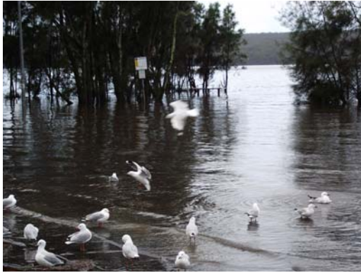
John Williams Boat Ramp.