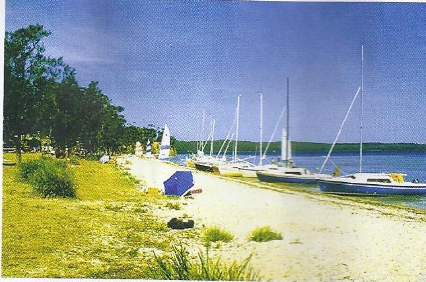
The foreshores & parklands around St Georges Basin.