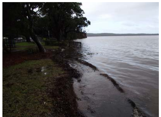
Ray Brooks Reserve (Palm Beach)