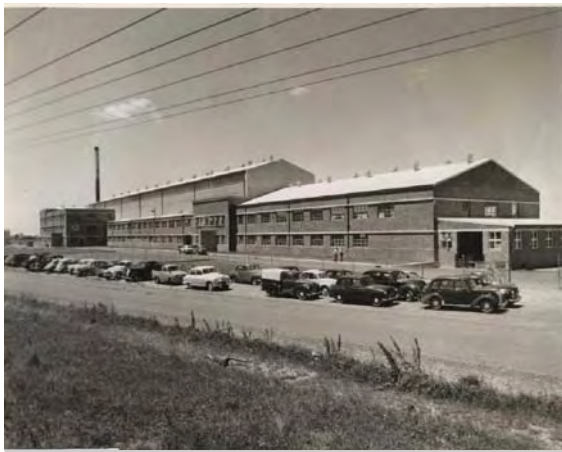
Mill Completed 1956

Don't be Sad for what we've lost... Be Happy for what we had!