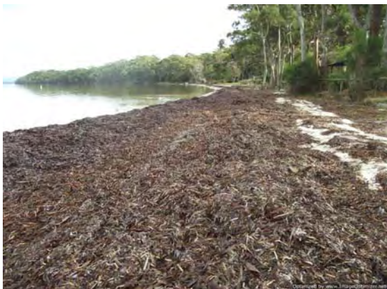
Current Condition of Palm Beach 30th May 2015