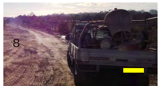
Photo 1 : Woolworths Leasing Plan Map. Photo 2: Woolworths Back Wall and Roof. Photo 3: Structure between Woolworth and Specialty shops. Photo 4: Woolworth Side Wall and Roof. Photo 5: Construction of Car Park Two. Photo 6: Construction Site looking from future Moona Creek Road in foreground. Photo 7: Close up of Construction Site. Photo: 8 Future Moona Creek Road, alongside of Construction Site Fence.