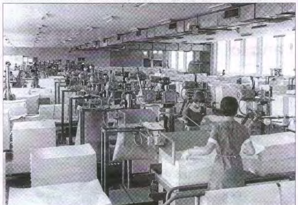
The La Salle room at the paper mill used to employ many local women who would count the reams of paper and check for imperfections.

to 8.30pm. For further details or to register your attendance contact Kerry Bates at the Australian Paper mill on 4428 6435. Numbers will be limited and RSVPs are needed by July 15.