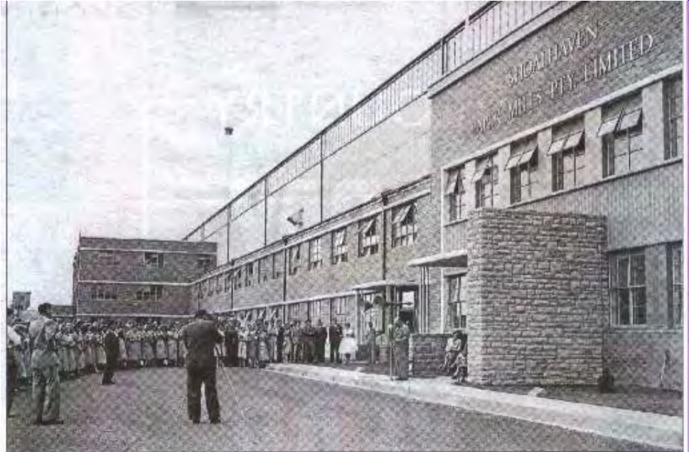
An official photo of the paper mill opening in 1956.

This Notice of the Reunion is an extract from Page 14 of the Shoalhaven and Nowra News—Friday, 26th June 2015.