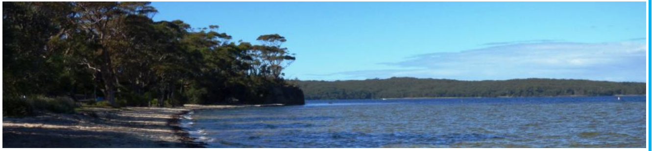
Photo of Palm Beach Sanctuary Point NSW on a clear day...