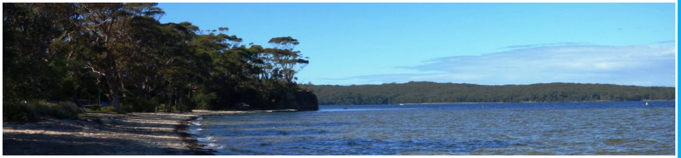
Photo of Palm Beach Sanctuary Point NSW on a clear day...