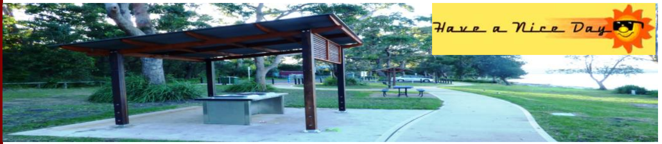
Photo of Palm Beach Sanctuary Point NSW...