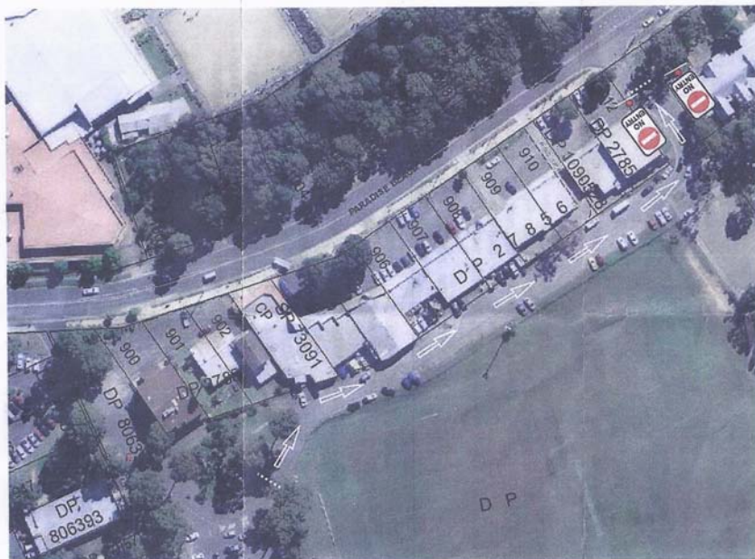
Proposed One Way Traffic Flow - Un-named Service Lane at the rear of the Sanctuary Point Shopping Centre

Inserted as a community service by the editor, as a concerned citizen of Sanctuary Point, in support of a better and safer approach for all concerned.