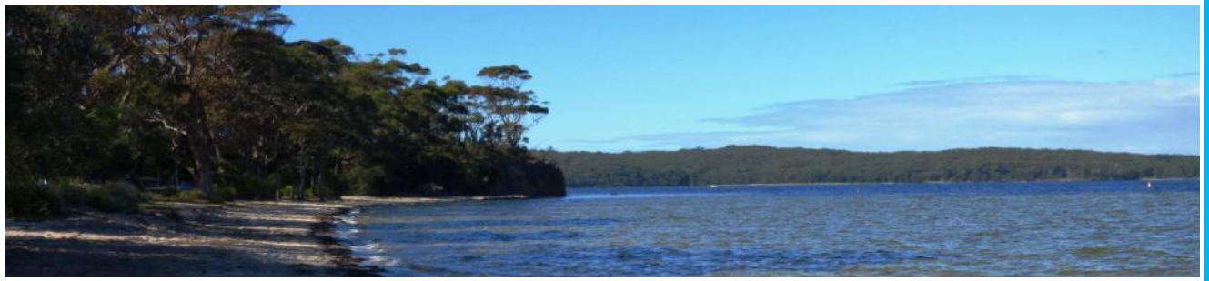
Photo of Palm Beach Sanctuary Point NSW on a clear day...