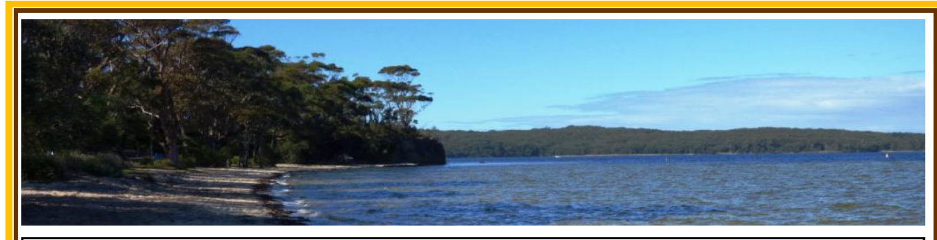
Photo of Palm Beach Sanctuary Point NSW on a clear day...