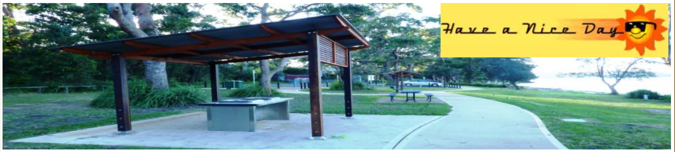
Photo of Palm Beach Sanctuary Point NSW...