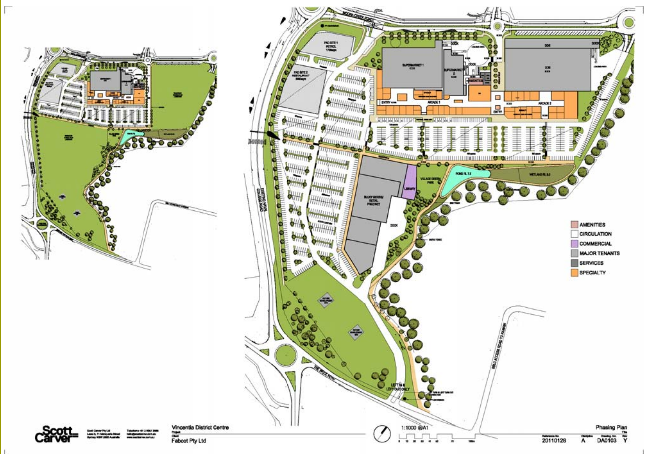
Exhibit A: Original Proposal and Modification 5.

Apart from our local community saving travelling time of a return trip, of at least one hour in a motor vehicle to Nowra, the fuel to travel the distance, the carbon pollution to our atmosphere and the potential hazards along the way, I believe that the Woolworth Market Place at Vincentia, will not only create many jobs in our local communities, it will encourage tourist opportunities to our towns and enforce our push for a permanent 24/7 Police station in our area.