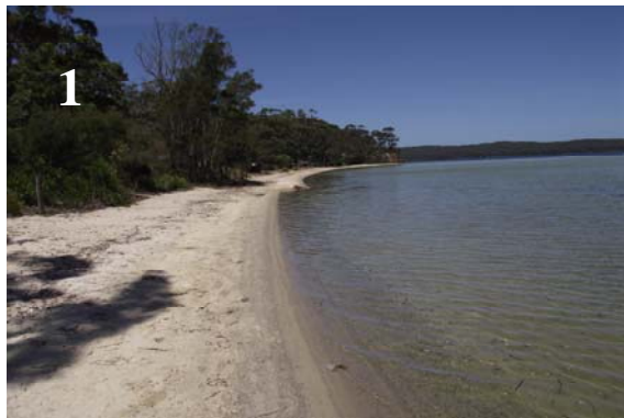
Pic 1 Christmas 2013

Sometimes being Negative can be very Positive! ( I believe this is one of those times! )