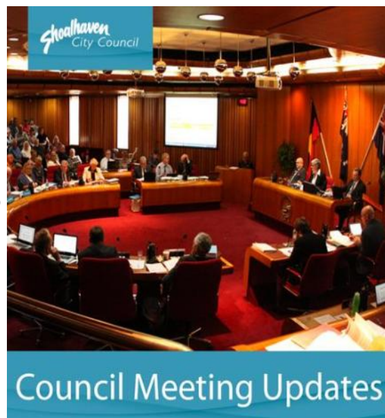
Council Meeting Updates

For agendas and minutes of Council Meetings, visit the Council website .