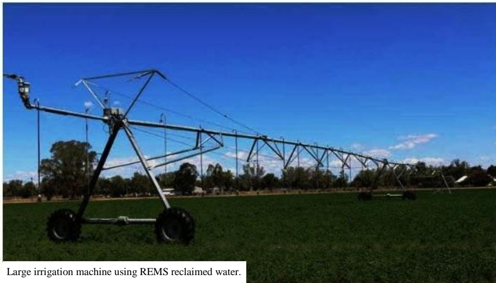
Large irrigation machine using REMS reclaimed water.

Shoalhaven Water's Reclaimed Water Management Scheme (REMS) is one of the largest and more complex water recycling schemes undertaken by a regional water authority.