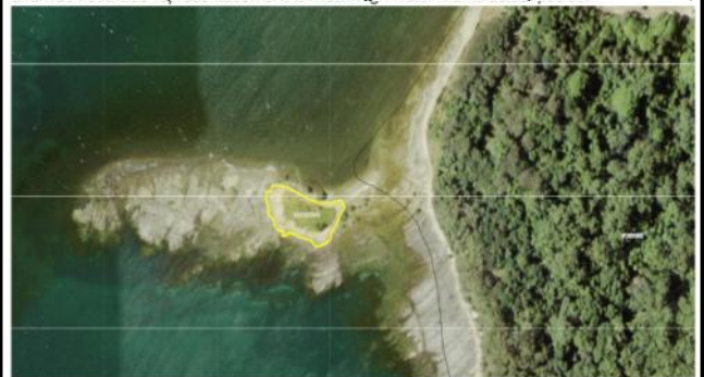
Image 6. Project Location, Lot 101 "Green Island" in DP 1263730 granted land parcel

Carama Creek and Green Island was defined in DP1263730 to enable granted land to be transferred. Lot 101, Green Island is shown below highlighted. The spit of land sits proud during low tide and all but the area defined is submerged during high tide. Access to and from the island at high tide was usually a waist deep wade, and early plans of the area show it attached to the mainland up until about 1915. This we believe was due to the low tide access and was not a true representation of the mean high water marks actual position.