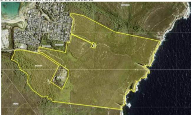
Image 5. Project Location, Lot 50 in DP 1264627 granted land parcel

The main site between the village of Currarong and the South Pacific Ocean is shown below. Its main purpose was to define Lot 50 (highlighted yellow) and carveout areas which were not claimable and were to remain in the state of NSW. Lot 50 is in the process of being transferred to the Jerrinja Local Aboriginal Land Council