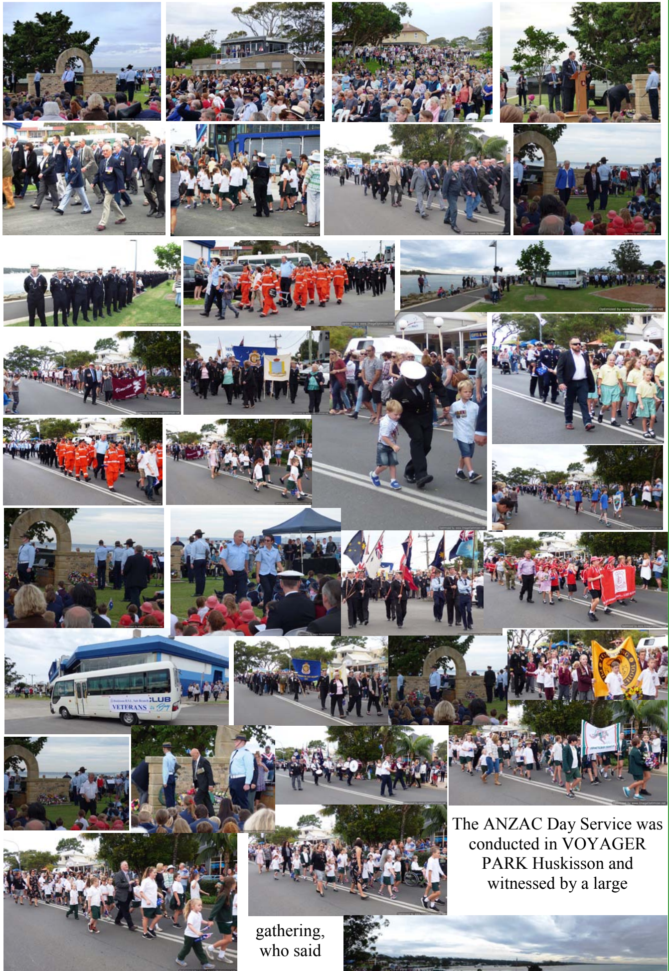
The ANZAC Day Service was conducted in VOYAGER PARK Huskisson and witnessed by a large