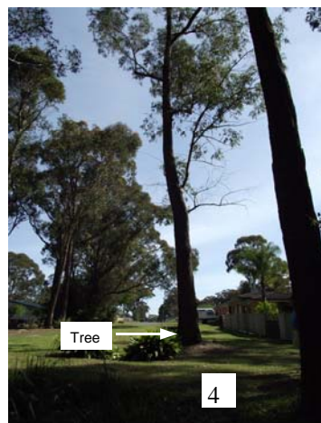
Photo 4 shows the height of the large tree on the side of the exposed canal, while photo 5 shows the undermining of a main root of the tree. Photo 6 indicates the depth of the canal in comparison with the residents fence ... by the way, the resident maintains the grass and looks