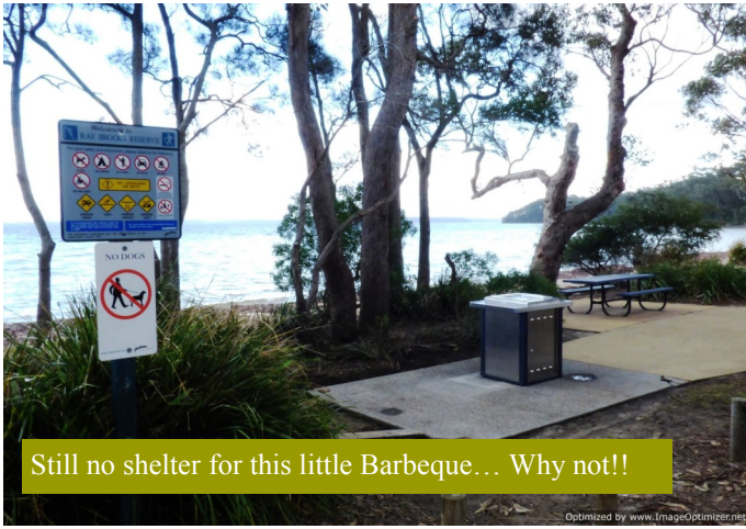
Still no shelter for this little Barbeque... Why not!!