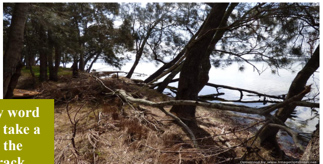
Don't take my word for it! Go and take a walk along the Walking Track through Paradise Beach, Sanctuary Point