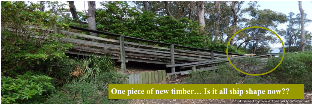
One piece of new timber... Is it all ship shape now??