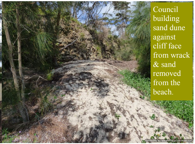
Council building sand dune against cliff face from wrack & sand removed from the beach.