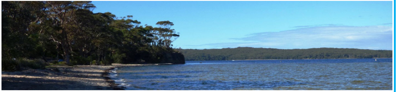
Photo of Palm Beach Sanctuary Point NSW on a clear day...