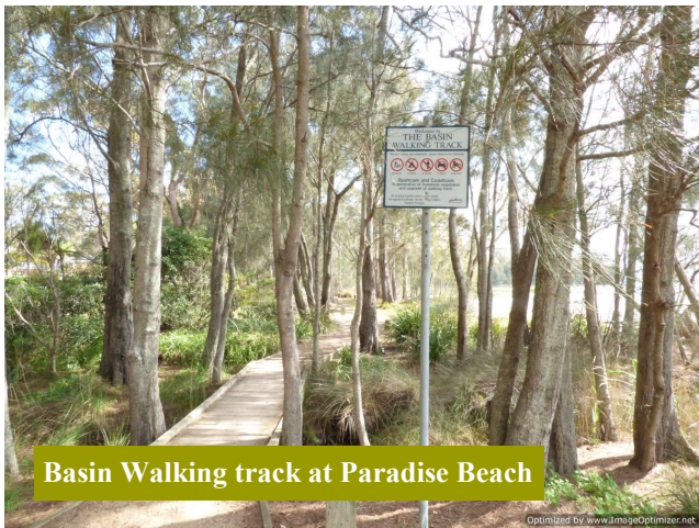
Basin Walking track at Paradise Beach