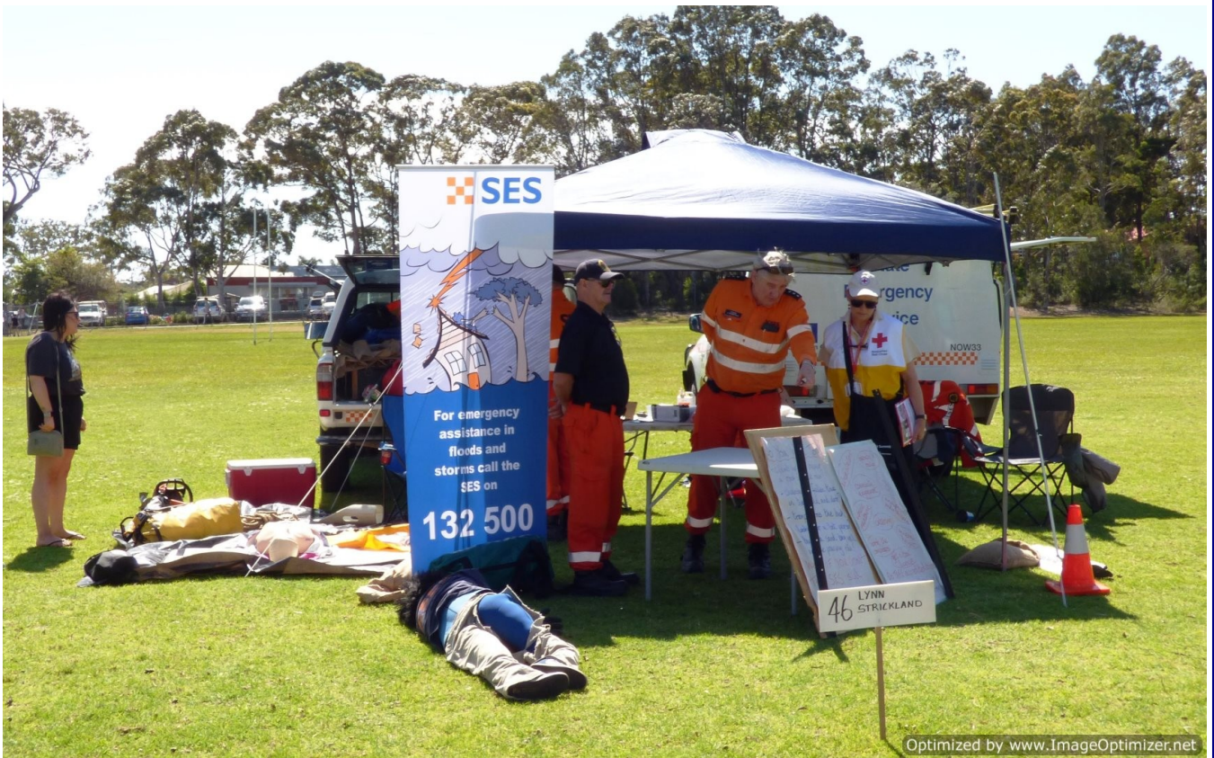
Optimized by www.ImageOptimizer.net