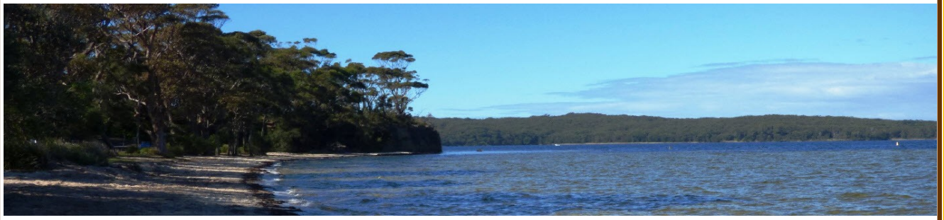
Photo of Palm Beach Sanctuary Point NSW on a clear day...