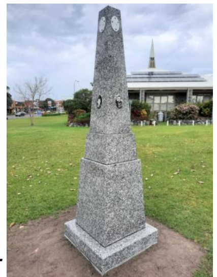
Image: Ulladulla Civic Centre Memorial Obelisk in Ulladulla.