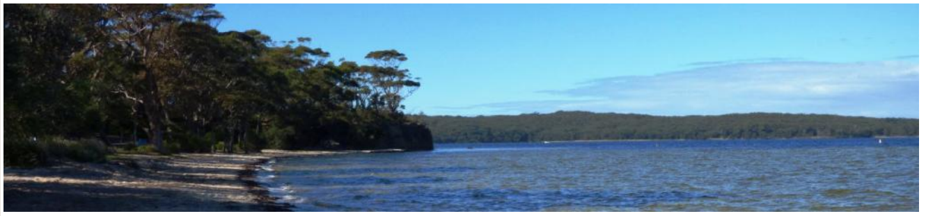
Photo of Palm Beach Sanctuary Point NSW on a clear day...