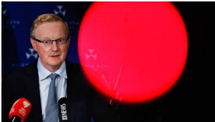
Reserve Bank of Australia governor Philip Lowe.

"Returning inflation to target requires a more sustainable balance between demand and supply."