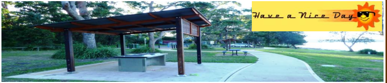
Photo of Palm Beach Sanctuary Point NSW...