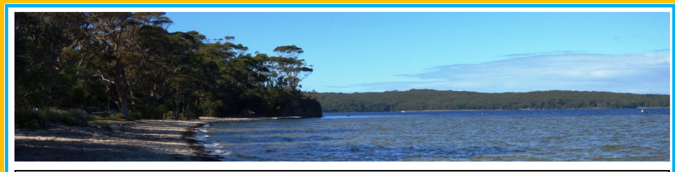
Photo of Palm Beach Sanctuary Point NSW on a clear day...