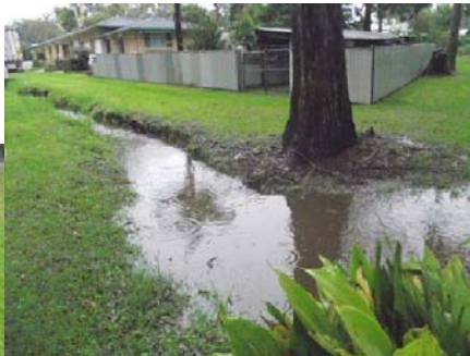
Before Council Intervention