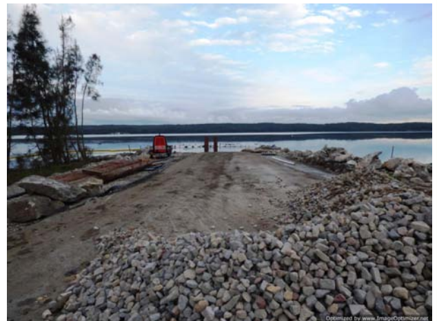
Have a look at the Current Projects to the left, on the Shoalhaven Council page... These should tell

you how our current Shoalhaven Council is getting on with the jobs they have encumbered, from previous councils...SO! WHO NOW WILL KEEP ON GETTING THE JOB DONE?