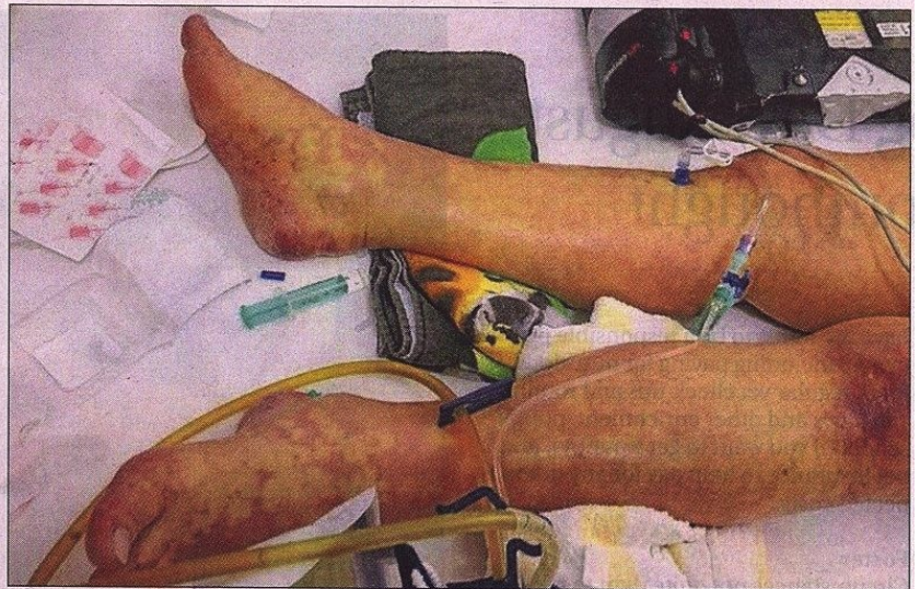
KNOW THE SIGNS AND ACT: Older Australians are among at-risk groups for sepsis.

As with most medical problems, early rec-