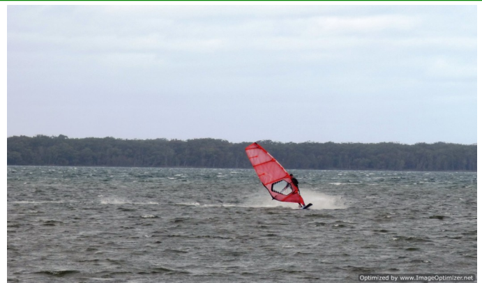
lone Windsurfer in his glory on the St Georges Basin, off Sanctuary Point 29th August 2019

For all Enquiries or to REPORT A LEAK Phone 4429 3214