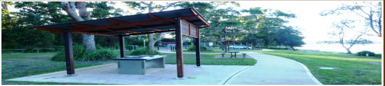
Photo of Palm Beach Sanctuary Point NSW...